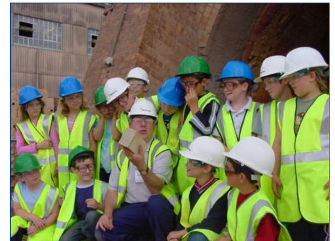
Local school children learn about the brick making process on a tour of the brickworks

Access to the Nature Reserve is strictly on the understanding that members stay within the fences (they are there for your safety) and that children are supervised by a responsible adult at all times.