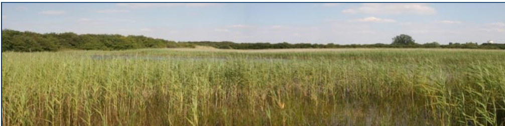
One of the largest reedbeds in Peterborough is part of the new Kings Dyke Nature Reserve extension

Kings Dyke Nature Reserve participates in the bi-annual BTO Business Bird Challenge. All sightings are added to our ever expanding data base which contributes towards the competition and helps monitor the success of the site management work.