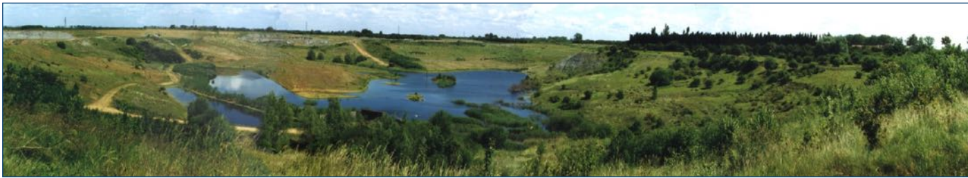
Kings Dyke Nature Reserve

Come and experience nature first hand. Hidden from view, you would never know that you were just a stones throw away from one of the largest brickworks in Europe, with only 3 tall chimneys in view as a reminder. Kings Dyke Nature Reserve offers a peaceful place to observe a wide range of wildlife, as well as trying your hand at some of the activities we have to offer.